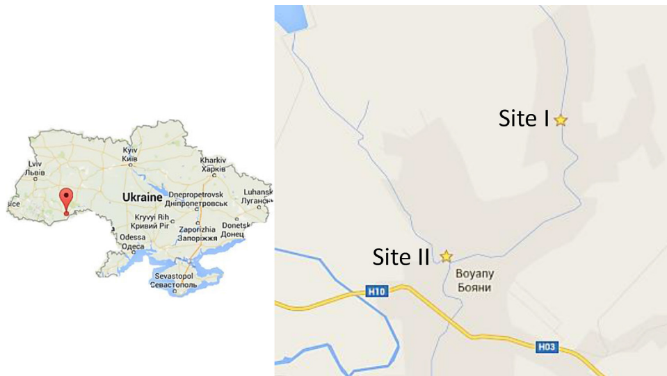
Fig. 2. Location of the study area (river Prut floodplain, Boyany, Chernivtsi Region, Ukraine). Study site I is colonized by Robinia pseudoacacia L.; study site II is forested with Salix spp.

For Salix spp. tree biomass was calculated using allometric biomass equations by Smith and Brand (1983) :